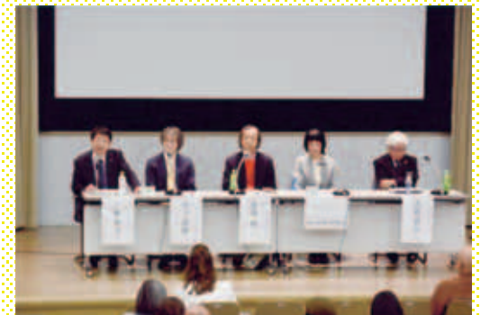
Open Public Seminar “Five Selected Topics on the Power of Resilience: Learning from the Atomic Bomb Experience” (March 2, 2019)

To contribute to civil society with knowledge and research outcomes, the CPHU offers an annual open public seminar in collaboration with the Hiroshima Peace Memorial Museum.